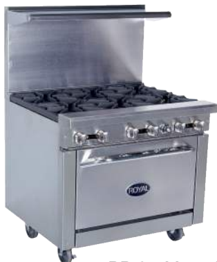
RR-6 with optional casters