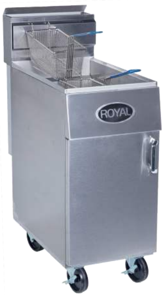
REEF-35 with optional casters