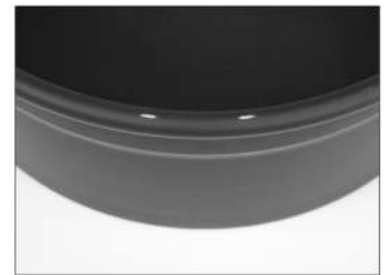
Grip marks from our anodizing process.