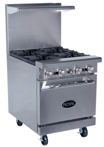
RR-4 with optional casters